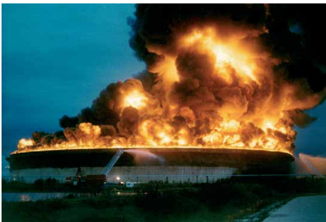
The Orion Tank Fire in 2001, world record in tank fire fighting.